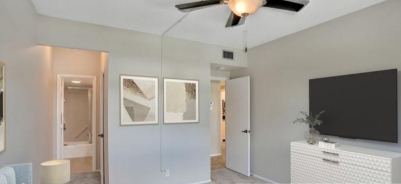
A11633053 © Miami MLS © 2024 VIRTUALLY STAGED