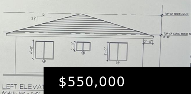
LEFT ELEVATION SCALE: 1/4" = 1'-0"