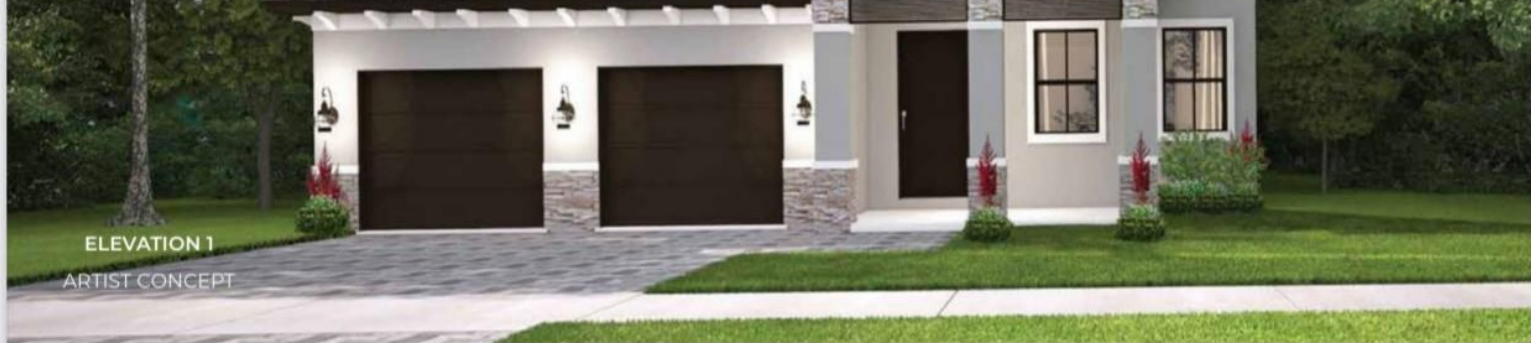
ELEVATION 1 ARTIST CONCEPT